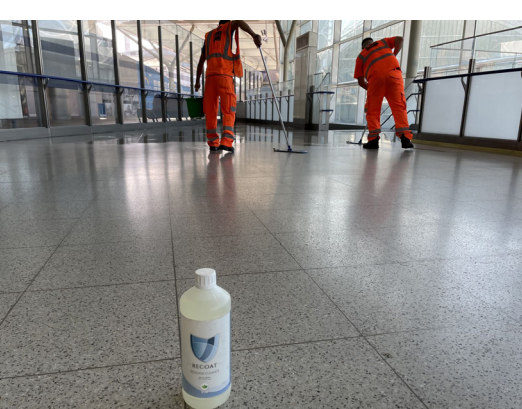
Step 2: Application of the Recoat Bonding Cleaner to ensure optimal adhesion to the terrazzo tiles without abrading.