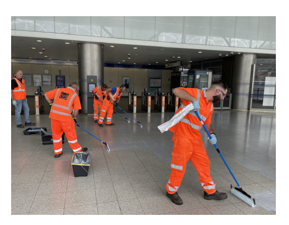
Step 3: Application Recoat Multi Primer Clear, universal, waterborne, clear primer which adheres exceptionally well to most substrates