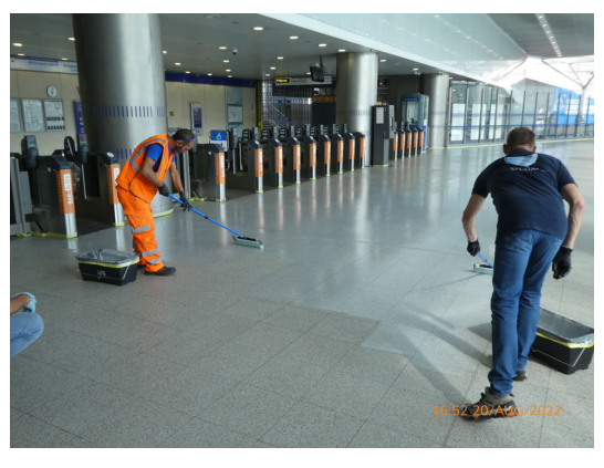
Step 4: Application of the Recoat Floor, extremely hard wearing Anti-Slip Coating.